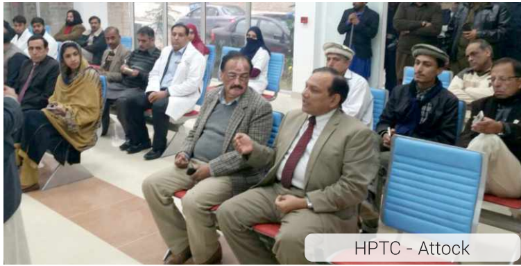
HPTC - Attock

PKLI&RC opened hepatitis prevention and treatment clinics (HPTC) in Attock, Jhelum, Kasur, Khanewal, Lodhran, Mandi Bahauddin, Nankana Sahib, Narowal, Rajanpur, Chiniot and Shujabad districts under its Hepatitis Prevention and Treatment Program (HPTP). Below are pictures of the clinics' opening moments.