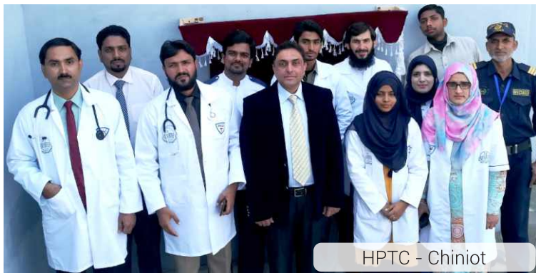
HPTC - Chiniot