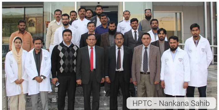
HPTC - Nankana Sahib