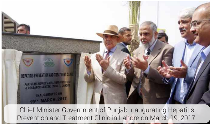
Chief Minister Government of Punjab Inaugurating Hepatitis Prevention and Treatment Clinic in Lahore on March 19, 2017.

unprecedented support and cooperation alongside professional guidance and recommendations for the launch of the huge project. PKLI&RC was formed through an Act of Parliament, "Pakistan Kidney and Liver Institute Act 2014", and got ratified by the Punjab Assembly.