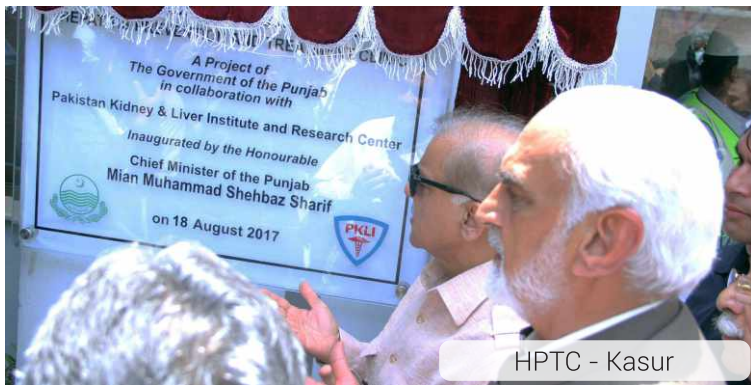
HPTC - Kasur