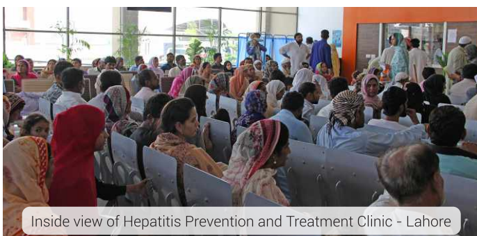
Inside view of Hepatitis Prevention and Treatment Clinic - Lahore