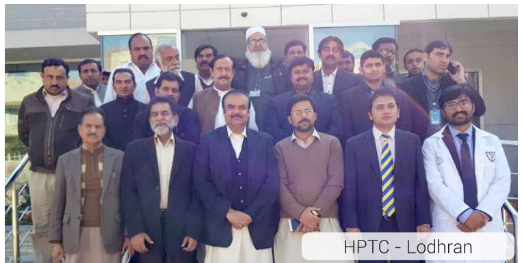
HPTC - Lodhran