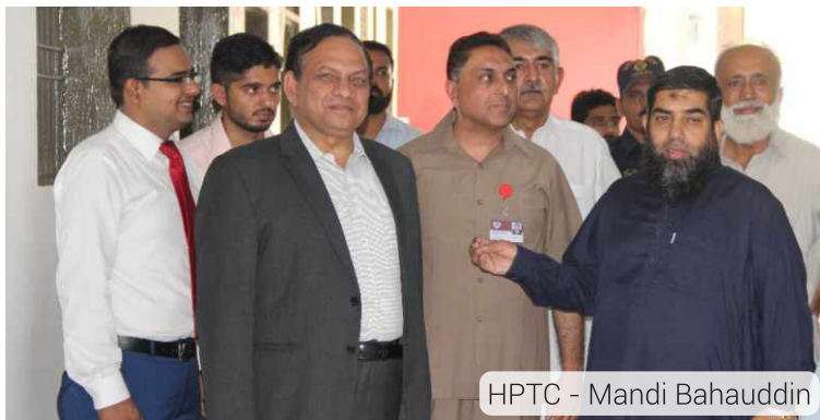
HPTC - Mandi Bahauddin