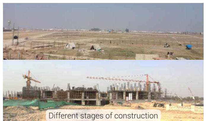
Different stages of construction

PKLI&RC was conceptualized as a "Hospital in a Garden." Consistent with the brilliant concept, the hospital