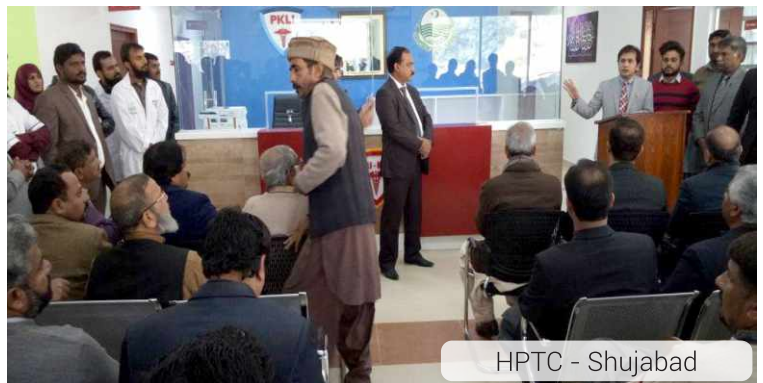
HPTC - Shujabad