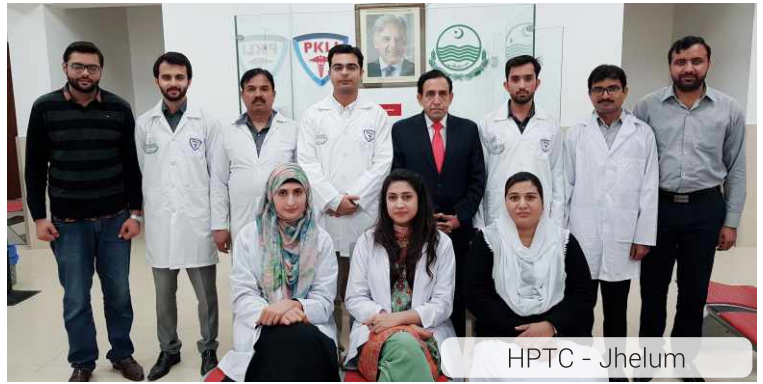
HPTC - Jhelum