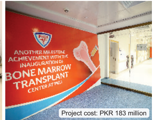
Project cost: PKR 183 million