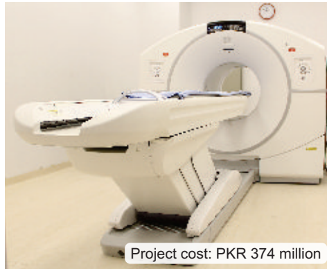
Project cost: PKR 374 million