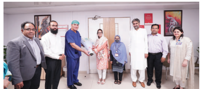
Obtained a Drug Regulatory Authority of Pakistan (DRAP) License for Phase III & IV clinical trials while adhering to high standards of GCP and GLP in line with PKLI's mission for top-quality research.