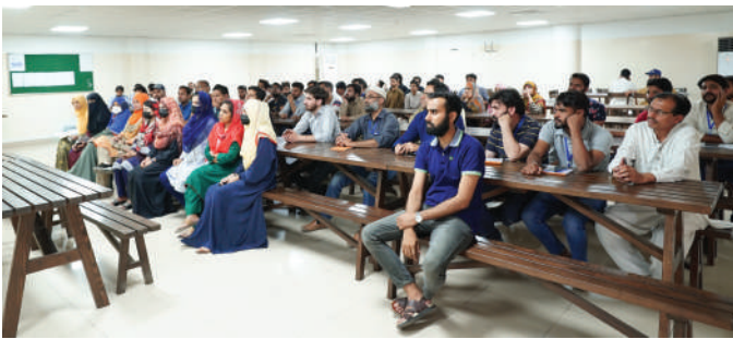
The Marketing department organized an awareness session on kidney disease prevention at Nishat Mills.