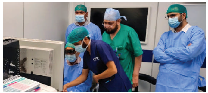
Dr. Javed Akram, the Caretaker Provincial Health Minister conducted a review of the robotic surgeries on April 18, 2023 being performed at PKLI.